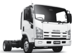
*Actual mirrors differ to those shown*