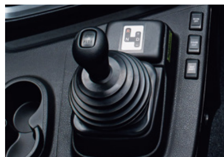
AMT model shown