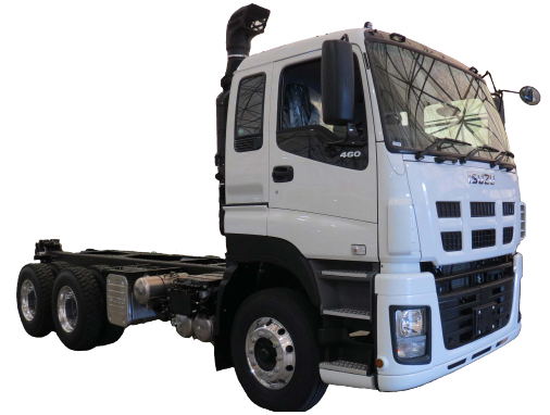
Engine Performance Curve 6WG1 TCS