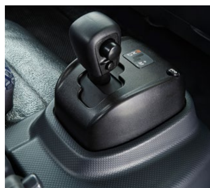
AMT model shown