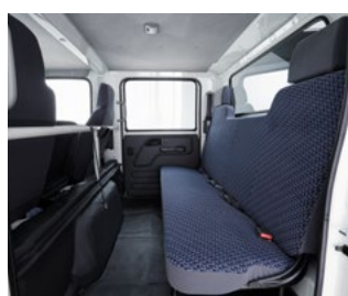
Crew cabin rear