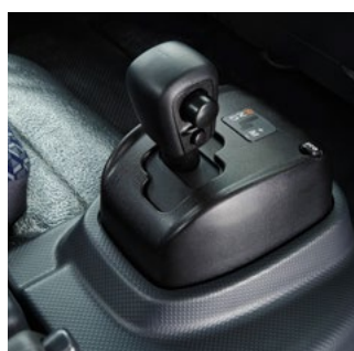
AMT model shown